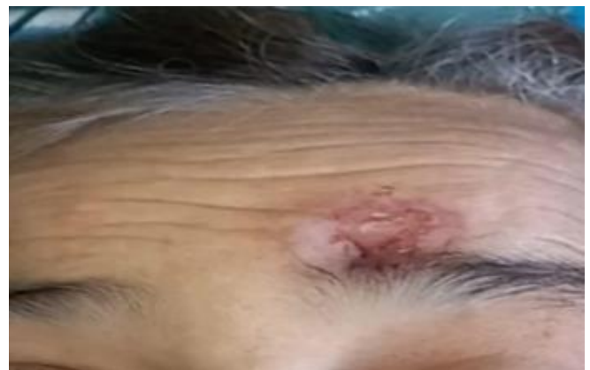
Figure 1: Frontal skin metastatic lesion

metastatic recurrence of a previously treated malignancy, as shown in our case 4 . The cancers most frequently associated with cutaneous metastases are breast, colorectal, and lung cancers 6,7 . Cutaneous metastases from head and neck cancers particularly nasopharyngeal carcinoma are extremely rare, accounting for less than 1% of cases, and are associated with a relatively poor prognosis 2 . The precise mechanism underlying cutaneous metastasis remains poorly understood. Several hypotheses have been proposed to explain the pathways of dissemination. Distant cutaneous metastases appear to spread primarily via the hematogenous route, whereas local metastases may disseminate through dermal lymphatic pathways or result from iatrogenic manipulation leading to tumor cell implantation 8,9 . There is no standardized therapeutic method for cutaneous metastases. Given the highly unfavorable prognosis and the metastatic nature of the disease, treatment is generally palliative. The prognosis remains poor, with a median survival ranging from 3 to 7 months 9 .